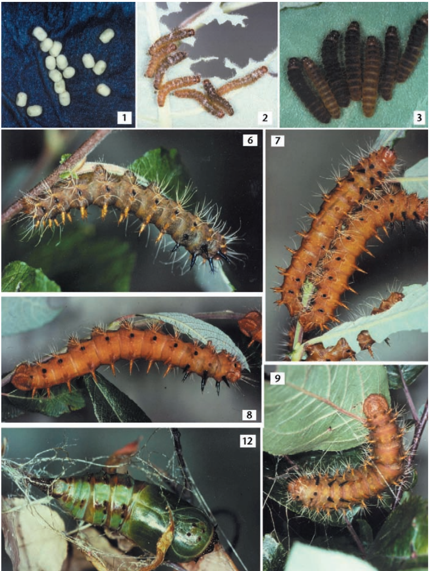
Colour Plates 1 & 2: Pseudantheraea discrepans . Cameroon. Fig. 1: ova. Fig. 1: L 1 . Fig. 3: L 2 . Fig. 4: L 3 . Fig. 5: L 4 . Fig. 6: L 5 . Fig. 7: L 6 . Fig. 8: L 7 . Figs. 9, 10: Praepupa spinning flimsy cocoon and shortly before pupation moult in cocoon. Fig. 11: Fresh pupa with larval skin. Fig. 12: Pupa in very flimsy cocoon. Caused by wind and movements of the food plant, the pupa may easily fall out of these few silken strands and then will hang freely in the plant, head down, held by the cremaster hooks in a silk bolster. Fig. 13: Pupa out of cocoon; see silk in cremasteral hooks. Figs. 14, 15: Imagines, Fig. 14 ♂, Fig. 15 ♀.